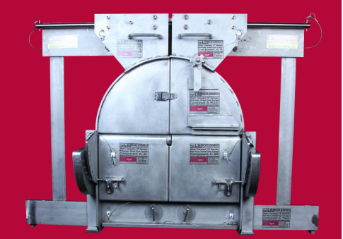
HEPA Adapter removed