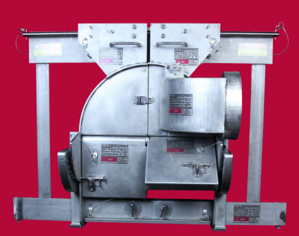
Roll-away doors closed