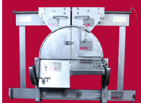
Swing door opened to maximum